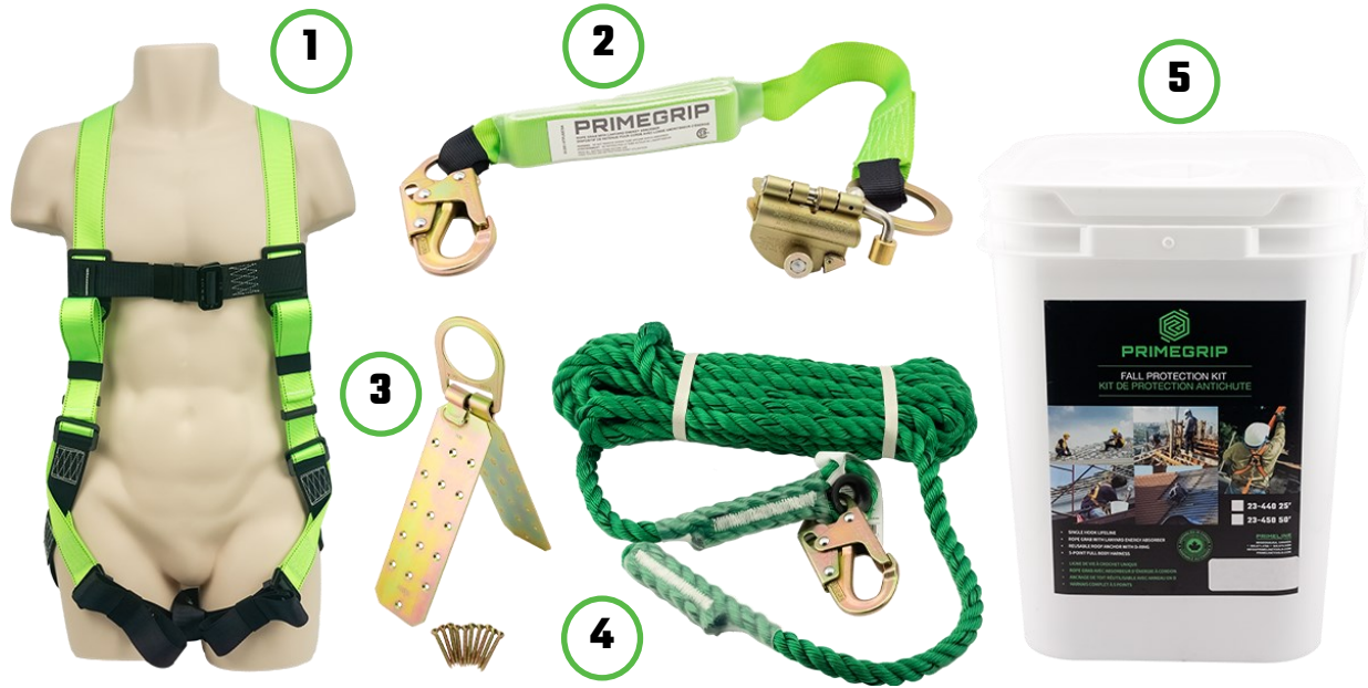
23-440 25' FALL PROTECTION KIT